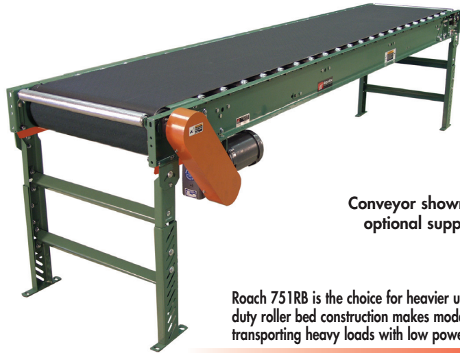
Conveyor shown with optional supports

24 HOUR SHIPMENTS INCLUDE ALL 1-FOOT INCREMENTS 5'-0" TO 100'-0"