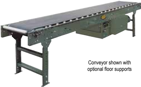
Conveyor shown with optional floor supports