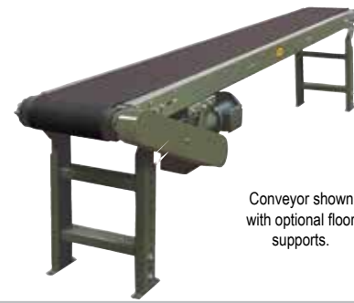
Conveyor shown with optional floor supports.