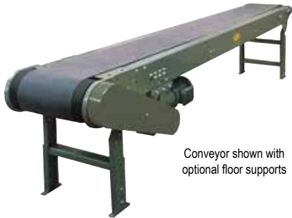
Conveyor shown with optional floor supports