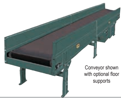
Conveyor shown with optional floor supports