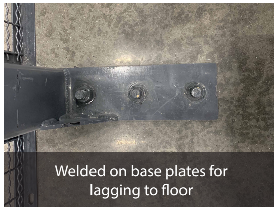
Welded on base plates for lagging to floor